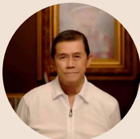
H. E. Korn Dabbaransi Former Deputy Prime Minister